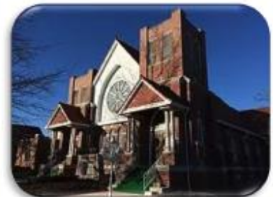
First Presbyterian Paola 110 E Peoria St Paola KS Worship 11:00 AM

We are a parish formed from congregations of unique identities, each with a long history of service to community. God calls us to be united in mission and ministry in our communities and to the world, with open hearts and minds, modeling Christ's love. Gathered in faith and nurtured by Word and Sacrament, we commit ourselves to share a hope for the future, to use our resources and talents guided by the Holy Spirit, and to work together to expand our ministry to serve others in the name of Jesus Christ.