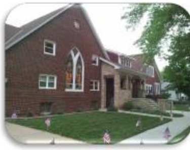
First Presbyterian Osawatomie 344 Main St Osawatomie KS Worship 9:30 AM