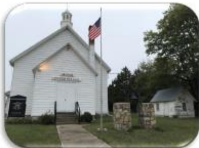
Miami Presbyterian Church 33110 Switzer Rd Paola KS Worship 8:00 AM